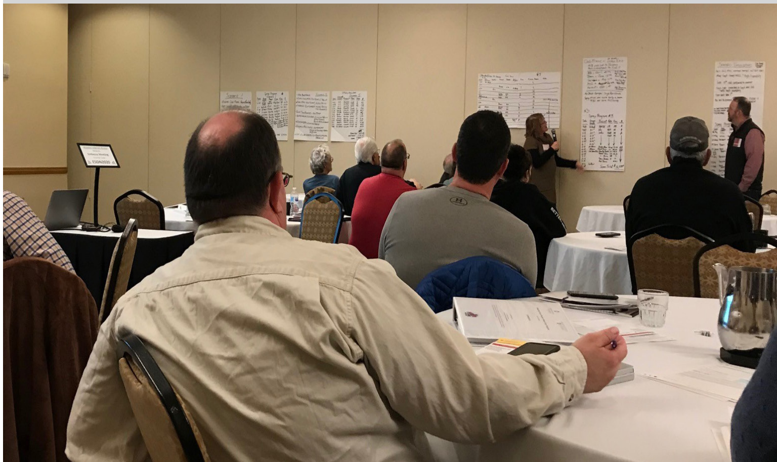
Photo: Defending disease management spray programs at the 2020 FRAME Network Workshop, Dublin, OH.