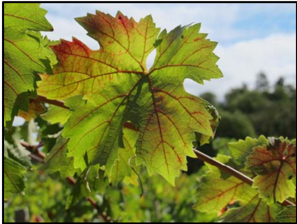
Red blotch and red veins on a leaf of Cabernet Franc grapevine.

DISEASE SYMPTOMS: The symptoms generally start appearing in late August through September as irregular blotches on leaf blades on basal portions of shoots. The secondary and tertiary veins turn partly or fully red. Occasionally, the reddening of leaf blade in the interveinal zones between secondary veins resembles those of leafroll diseases, but the leaf margins do not roll downward. Also, in leaf-roll affected red varieties the secondary and tertiary veins remain green. It is not known if the disease has any effect on fruit yield, and cause vine decline. The most significant impact of the disease appears to be on the Brix units of the berries. Brix of grapes in vines showing red blotch symptoms has been found to be 4 to 5 units lower than those with green canopies and this difference is higher than those normally seen in leafroll-affected grapevines.