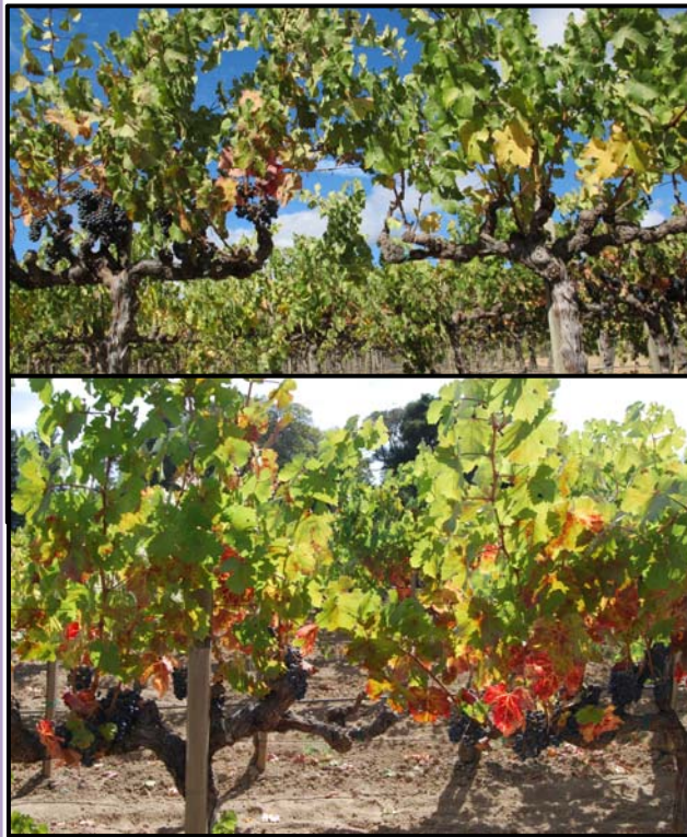
Cabernet Franc grapevines showing red blotch disease (top left and bottom) and harvested normal grapevine (top right), October 2012.

ETIOLOGY: The disease symptoms do not appear to be caused by nutritional deficiencies nor by stress, nor by bacteria, fungi and/or nematodes. A unique DNA virus was found