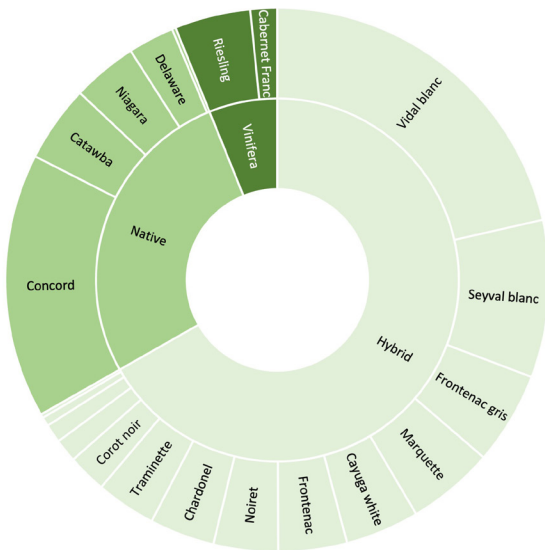
Fig. 3. Proportion of total yield (tons) of production by classification (vinifera, hybrid, native; inner circle) and proportion of total planted acreage by cultivar (outer circle)

In total, data was reported for 30 cultivars (Fig. 2, Table 1). These cultivars represented ‘native’ ( V. labrusca , aestivalis ), interspecific hybrid (‘hybrid’), and V. vinifera (‘vinifera’) species. Hybrid grapes comprised the majority of the total acreage for the 2024 survey (43.4%), followed by natives (18.0%), and vinifera (12.6%; Fig. 2).