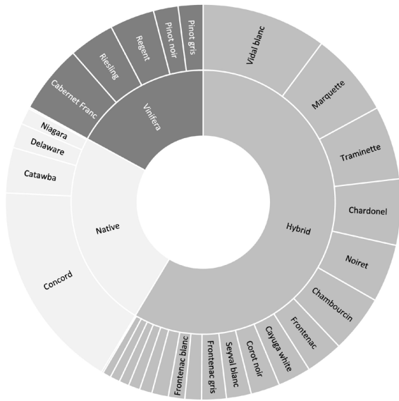
Fig. 2. Proportion of total planted acreage of production by classification (vinifera, hybrid, native; inner circle) and proportion of total planted acreage by cultivar (outer circle)

acres. Similar to previous surveys, median vineyard size was 3 acres (n = 11). Bearing acreage accounted for 87.5% of the total planted acreage.