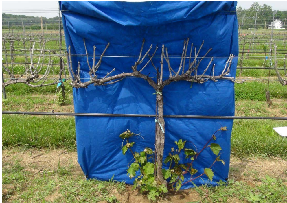
Fig. 3.1. Dead buds, canes/spurs, cordons and trunks. The weak and low number of graft suckers (1-2) and presence of rootstock growth is an indication of low probability of vine recovery.