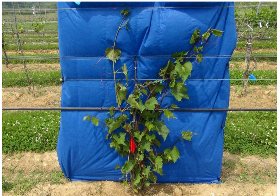
Fig. 4.3. The vine's graft (scion) is dead, but the vine's rootstock (green shoots) is alive. In this situation, the rootstock must be removed and the vine replaced.