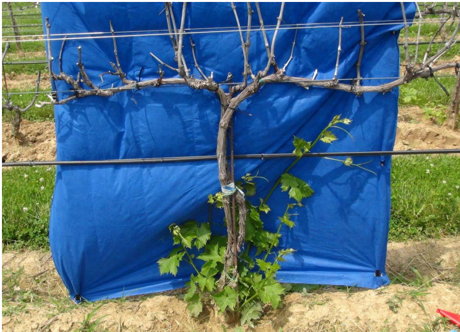
Fig.2.1. Dead buds, canes/spurs, cordons and trunks. But shoot growth (suckers) of vine's graft (or scion) from trunk base or graft union. Suckers from the vine's graft can be trained to new trunks and cordons.