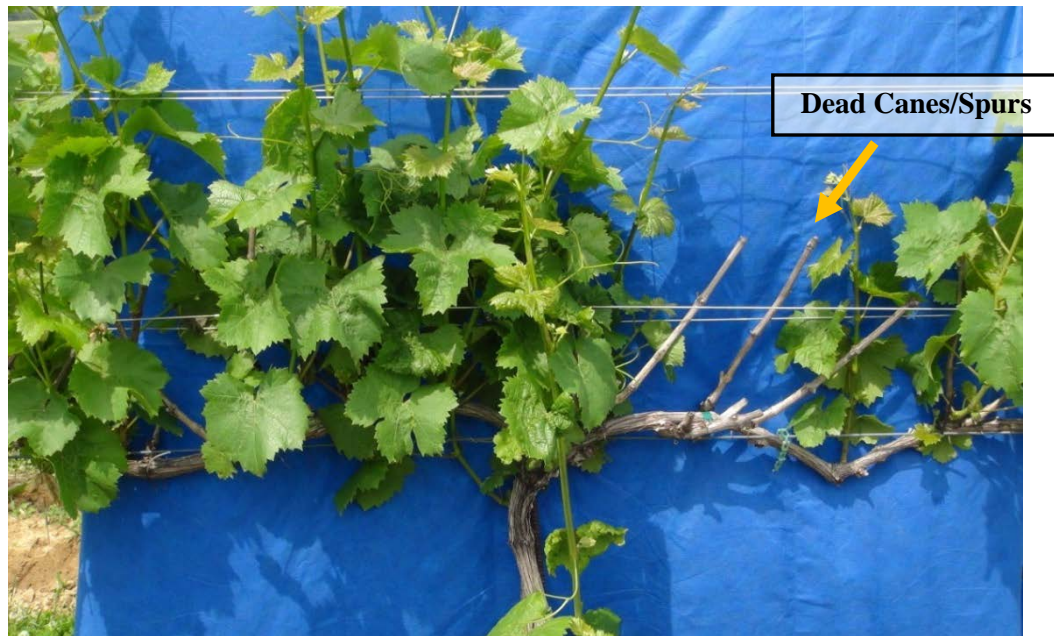
Fig. 1.2. Close-up showing dead buds on dead canes/spurs, but live shoots from cordons.

Note: Vines may have sustained vascular damage (not visible) which causes “vine collapse” in late summer. In this case, vines cannot be rehabilitated and needs to be replaced.