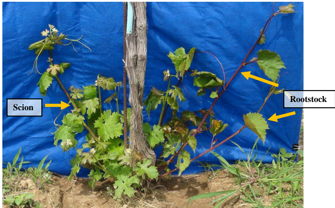
Fig. 3.2. Close-up to show the graft (scion) and the rootstock. To distinguish between the two, note the stem color and leaf shapes are different.