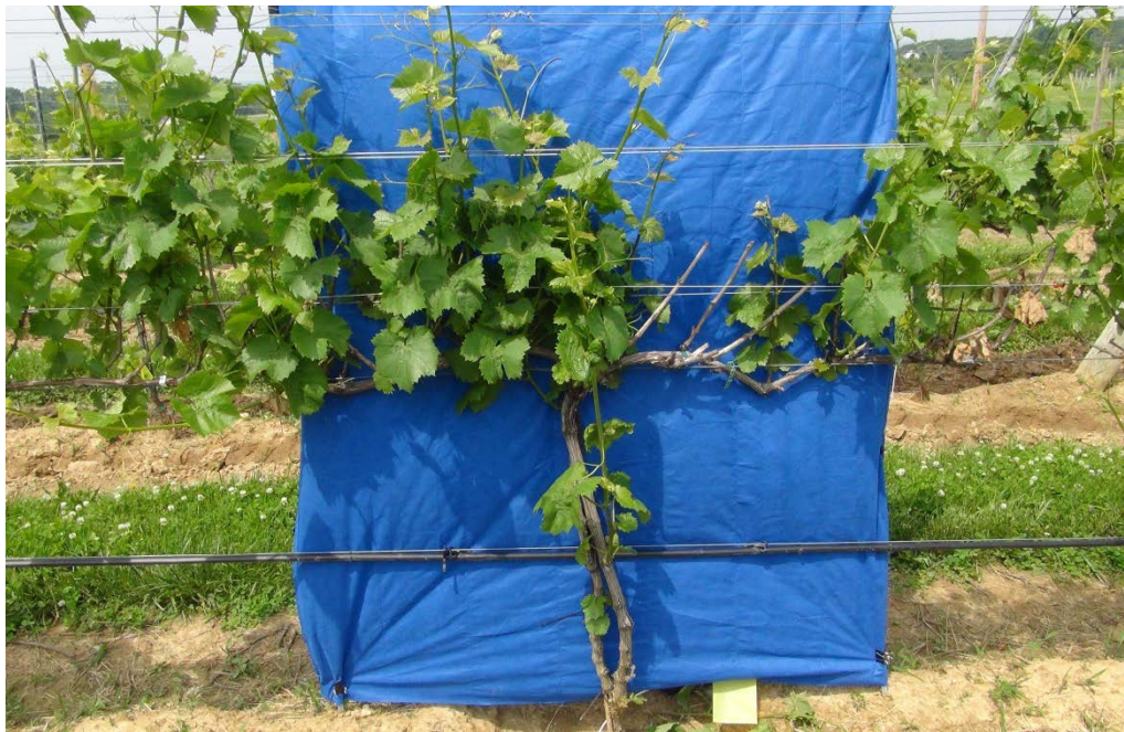
Fig. 1.1. Despite bud damage and crop loss in 2014, this vine will recover if no vascular tissue injury occurred.