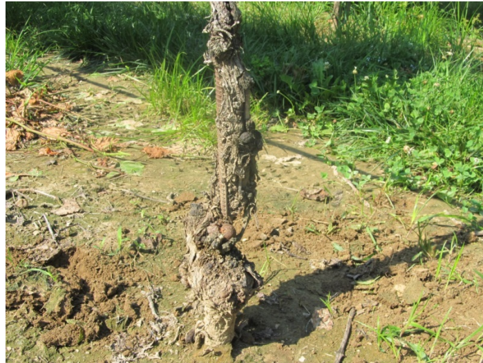
Fig.2.3. Presence of crown gall at or above the graft union Reduces the probability of vine recovery.

Note: Suckers from vine's graft are susceptible to breakage in early summer (wind, machinery, training, etc). If fewer than four suckers remain and showing fast growth (longer internodes than normal) then those vines with "bullwood" (bull cane) are unlikely to recover. Also, presence of crown gall will reduce the probability of recovery. In all these cases, vines cannot be rehabilitated and should be replaced.