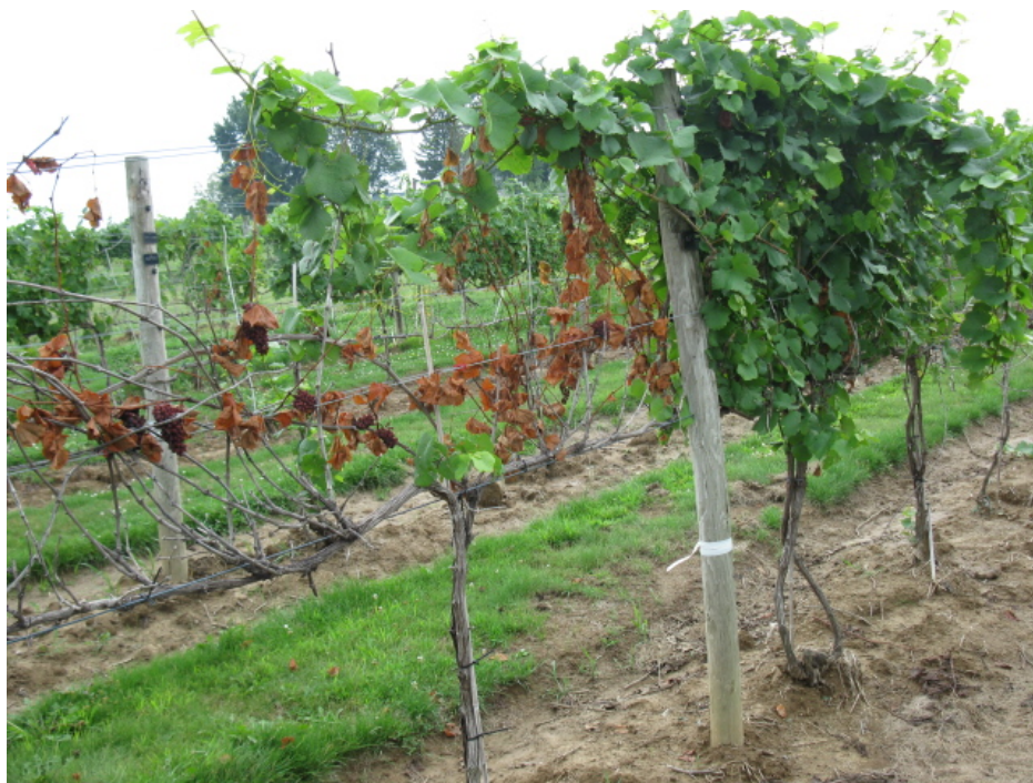
Fig. 1.3. Vine collapse of Pinot gris (due to vascular tissue damage) following the 2009 freeze in Wooster, OH. Photo was taken later in the season in August 2009.

Note: Vines may have sustained vascular damage (not visible) which causes “vine collapse” in late summer. In this case, vines cannot be rehabilitated and needs to be replaced.