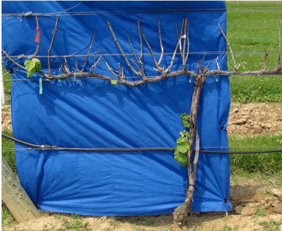
Fig. 3.4. Weak shoot growth on cordons and mid-trunk is an indication of severe damage to the vascular system of the vine. Vine will eventually collapse later in the summer and should be replaced.