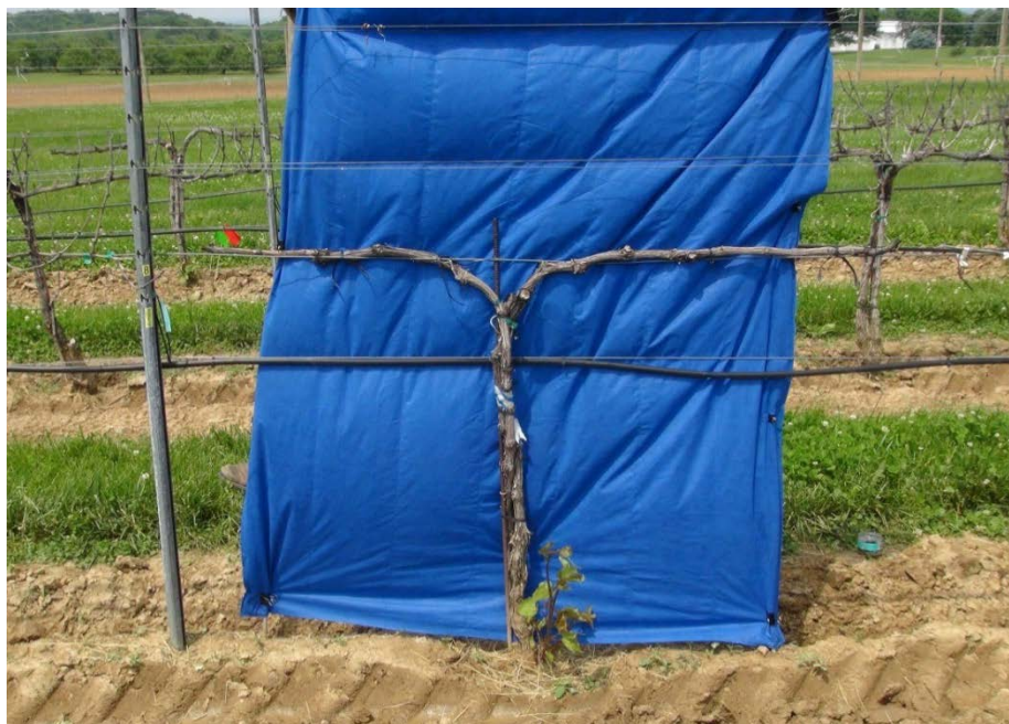
Fig. 4.1. Dead cordons and trunks. This vine's graft (scion) is dead and the growth at the base is of a rootstock. In this situation, the vine's rootstock must be removed and the variety replaced.