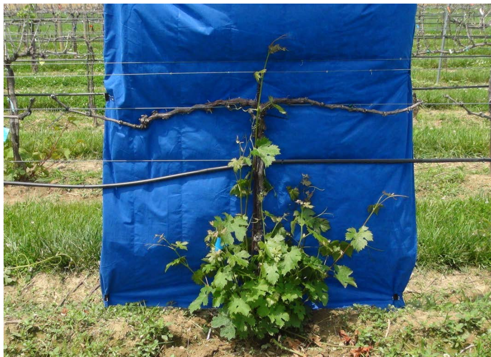
Fig.2.2. Dead cordons and trunks. But shoot growth (suckers) of vine's graft (or scion) from trunk base or graft union. A large number of suckers is favorable to retrain vines.