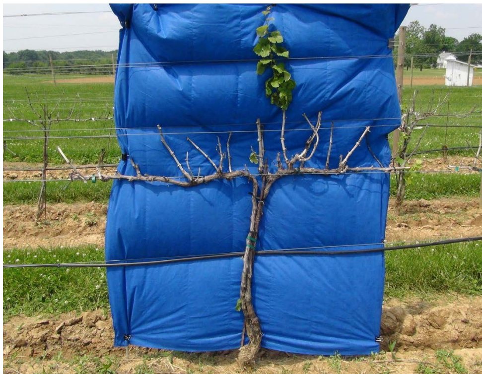
Fig.3.3. Minimum and sporadic shoot growth on spurs, cordons and trunks is an indication of severe damage to the vascular system of the vine. The vine will not recover and should be replaced.